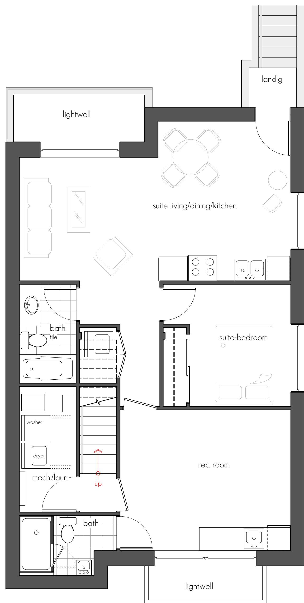
BASEMENT FLOOR PLAN scale: 1/4" = 1'-0" ceiling height: 8'-0" proposed floor area : 1,032.5 sq.ft. (gross) proposed rear open sunk. patio area : 727 sq.ft